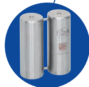
GRANDER® Energy Rods