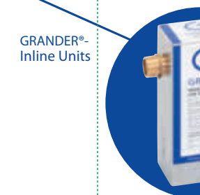
GRANDER®- In-line Units