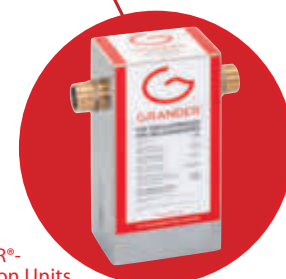
GRANDER®- Circulation Units